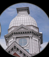
Sheet Metal Fabrication