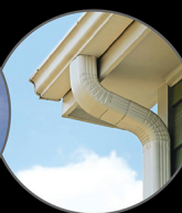
Gutters & Downspouts