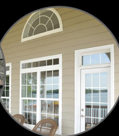
Siding & Windows