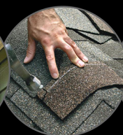
Service & Repair